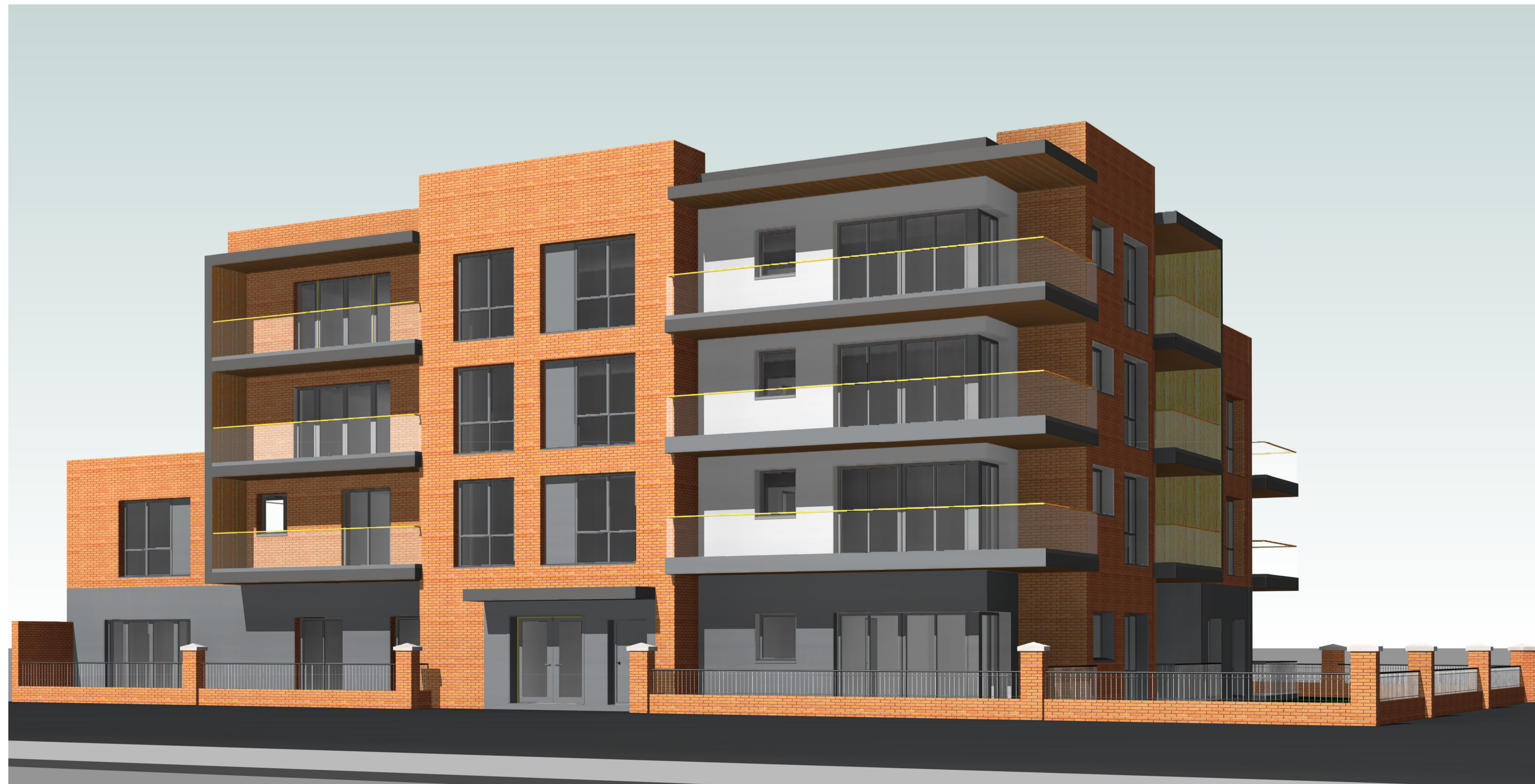
2 3D View from the main road @A1

Notes: DO NOT SCALE FROM THIS DRAWING. USE FIGURED DIMENSIONS IN ALL CASES. VERIFY DIMENSIONS ON SITE AND REPORT ANY DISCREPANCIES TO THE ARCHITECTS IMMEDIATELY. THIS DRAWING IS TO BE READ IN CONJUNCTION WITH THE ARCHITECTS SPECIFICATION. © THIS DRAWING IS COPYRIGHT AND MAY ONLY BE REPRODUCED WITH THE ARCHITECTS PERMISSION.