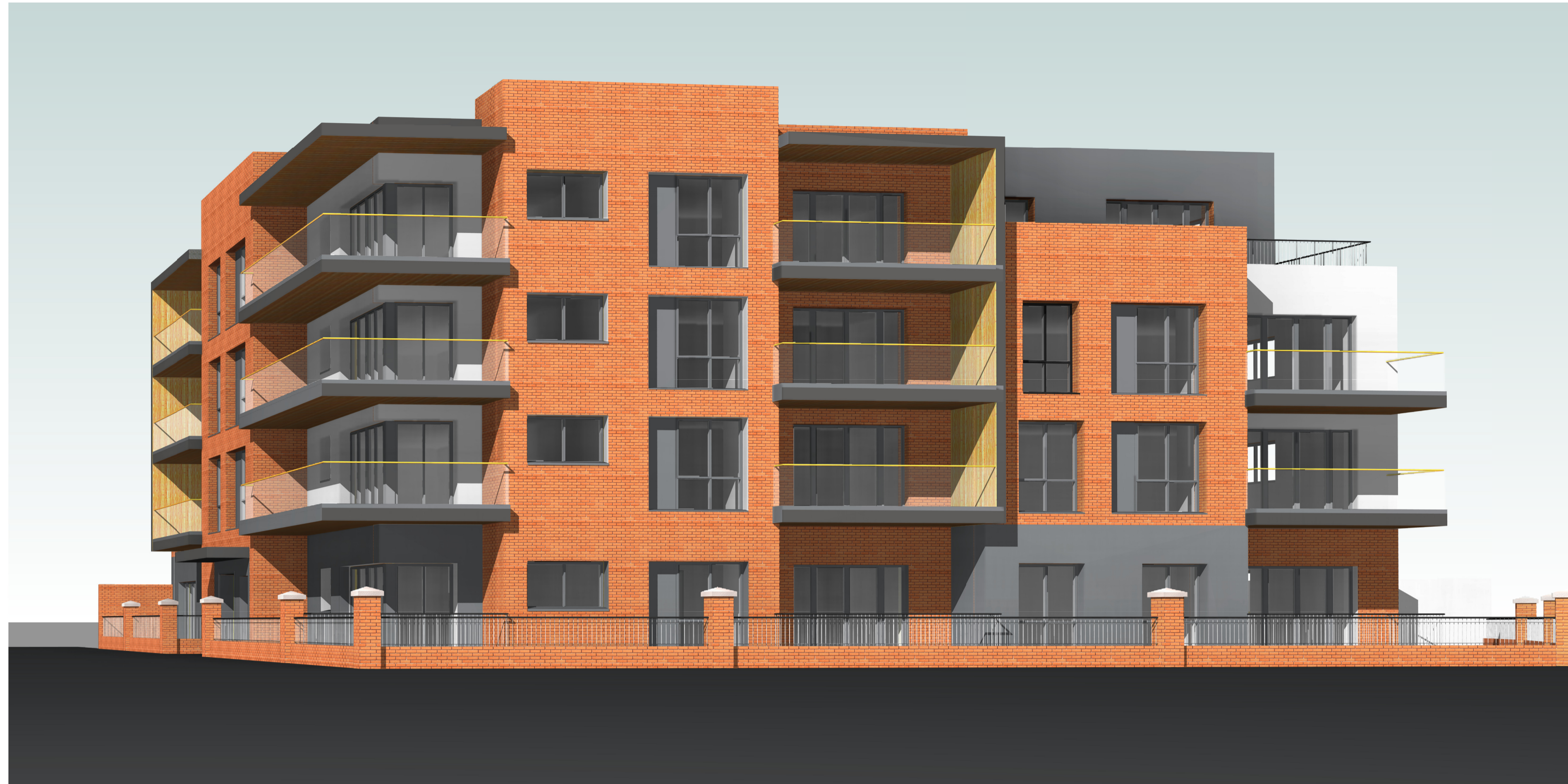
1 3D View from the future Bridge @A1